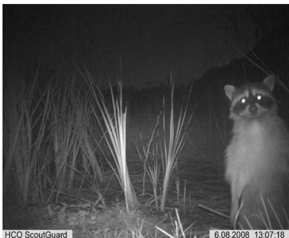
Friendly night visitor checking out the Critter Cam (photo: raccoon, Procyon lotor ).

For additional photos and video from our Critter Cams, please check out our Flickr ( www.flickr.com/ballonarestoration ), Facebook ( www.facebook.com/ballonarestoration ), and Youtube ( www.youtube.com/ballonarestoration ) sites.