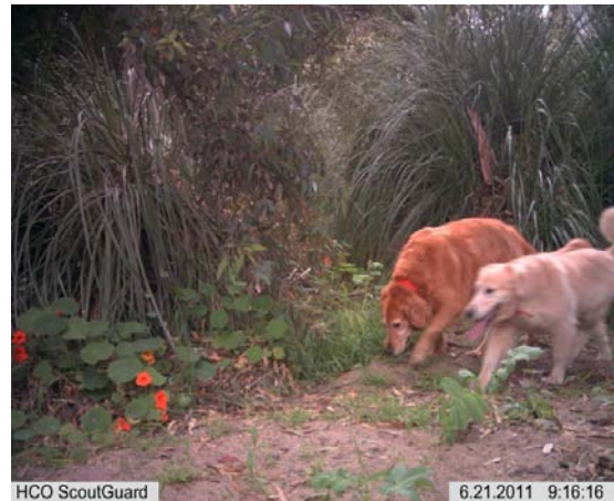
Uh oh! Off leash dogs = bad news for native wetland species and birds! (right photo)