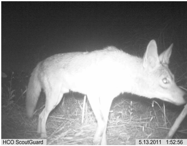
Out for an evening trek through the Reserve (left photo: coyote, Canis latrans ).